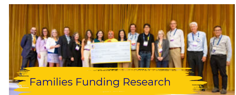
Families Funding Research