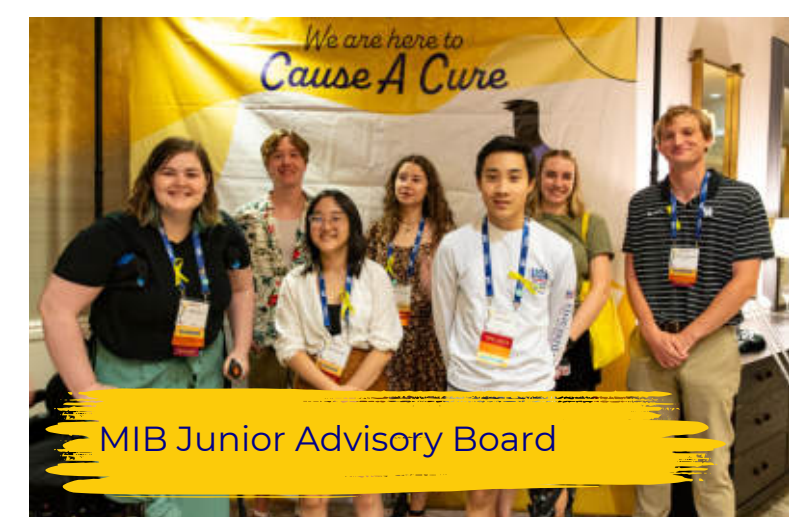
MIB Junior Advisory Board