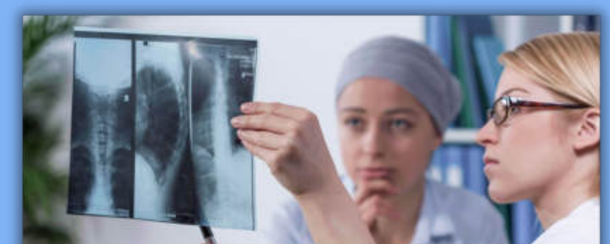
Selecting a Sarcoma Treatment Center: How to Find a Chondrosarcoma Oncologist / Treatment Center