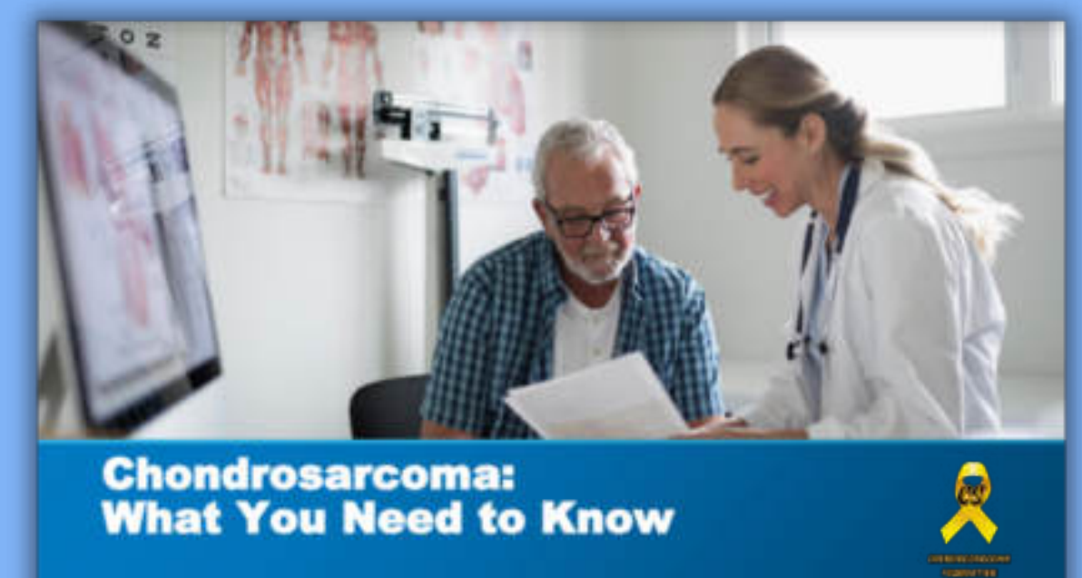
Chondrosarcoma: What You Need to Know